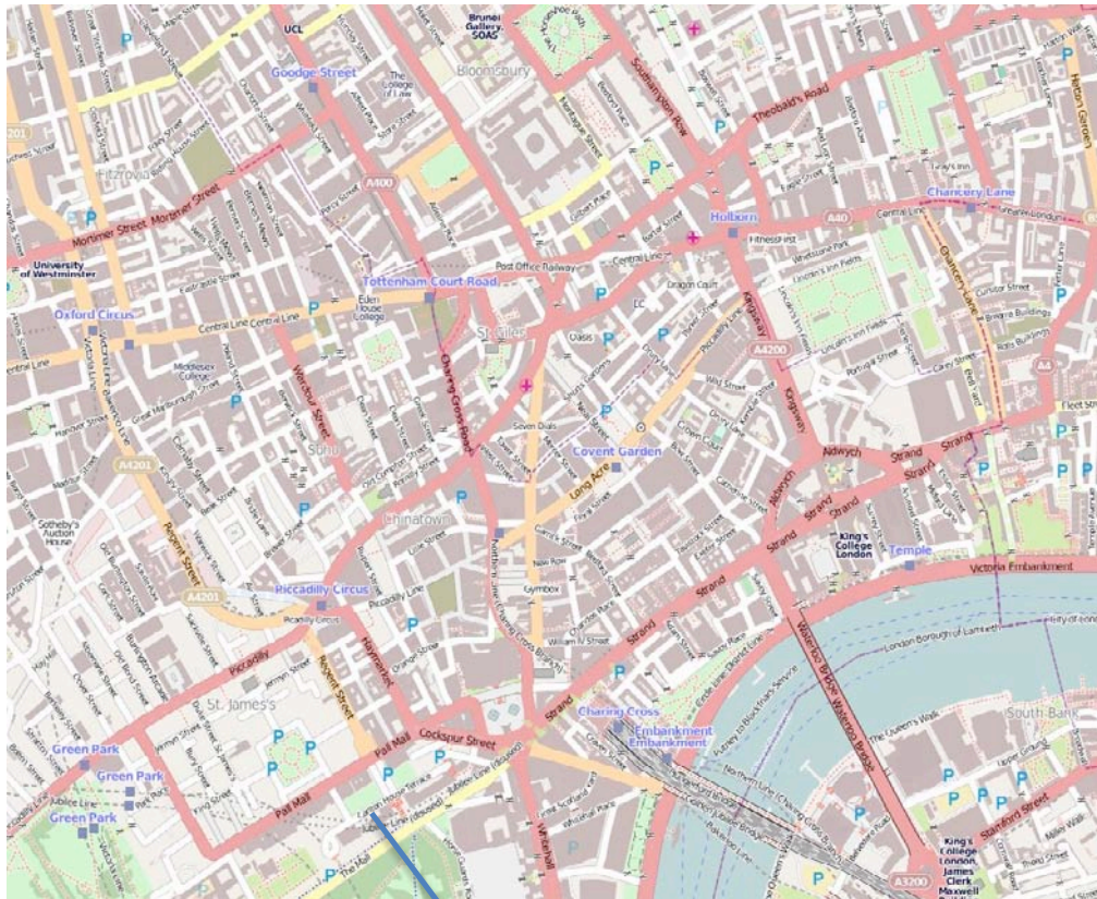
Royal Society, Carlton House Terrace